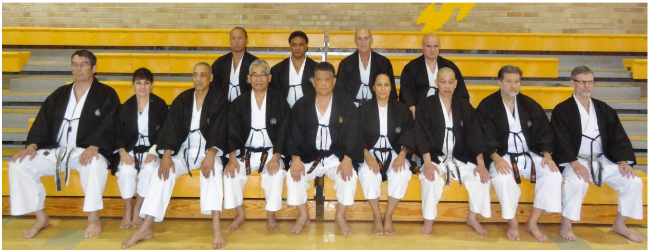
Senior Members of the IKD Shihan-Kai in Judge's Uniform