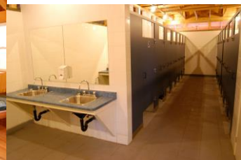
Washrooms and Showers

To all members, friends, and future members, please make every effort to attend the 2017 IKD World Camp. Please show your support of our efforts and aims, and be part of IKD Karate History. I look forward to meeting and greeting you at camp, and thank you very much for your continued support!