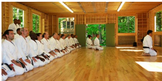
TV Rec Dojo

Both seminars are optional, and will require gis.